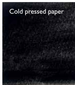
Cold pressed paper